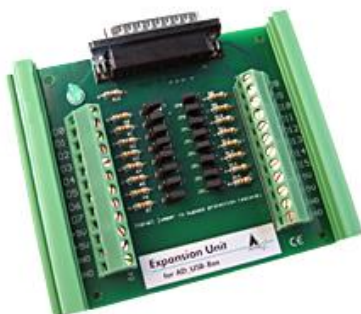
Expansion Unit for AD_USB-Box (scope of supply)

The AD_USB-Box provides 8 single-ended or 4 differential analog inputs respectively, and 4 digital inputs. Additional 16 digital inputs (24 VDC) are available by connecting the Expansion Unit , which is included. The inputs of the Expansion Unit are extra protected against short circuit and surge.